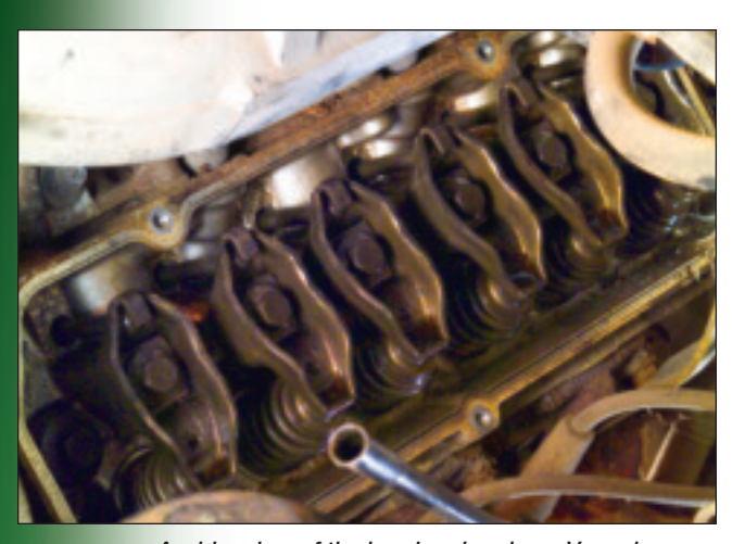
A wider view of the head and rockers. Very clean.