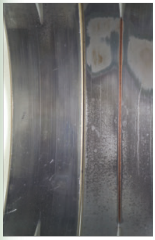
Engine main bearing halves show very little wear and are still suitable for continued use.

Each truck produces six quarts of waste-oil per oil change. With 60 vehicles being serviced every four months, that's 360 gallons per year. By switching to AMSOIL Guardian Pest Control prevents the disposal of 720 gallons of waste-oil every year. The environmental impact of this savings is enormous. It also frees up shop space that would be eaten up by drums of used oil.