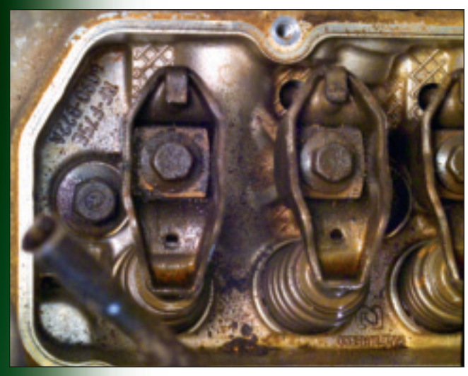
The head and rocker arms were very clean and free of heavy deposits. Note that you can still see the honeycomb stamping and manufacturer's part number. This is normally an area of the engine where you would see heavy varnish deposits with a conventional engine oil.