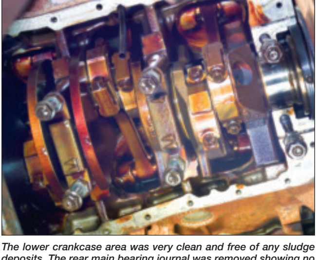
deposits. The rear main bearing journal was removed showing no signs of visible wear on the crankshaft journal.