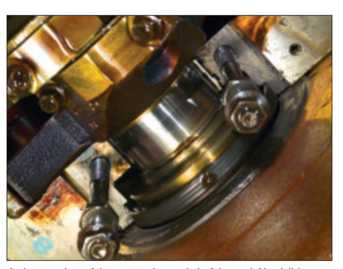
A closeup view of the rear main crankshaft journal. No visible wear detected.