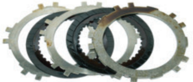
Automatic transmission clutch plates after cleanup with AMSOIL Engine and Transmission Flush reveal lighter glazing and varnish.