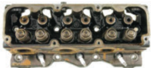
Cylinder head pre-cleanup. Note the sludge deposits on and around the valve springs and push rod openings.